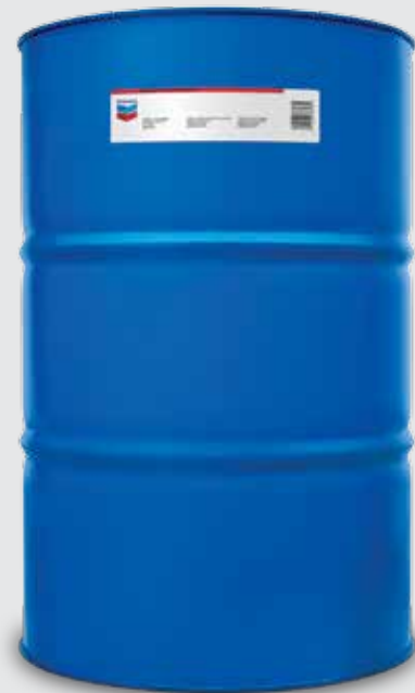
GST® Premium 32